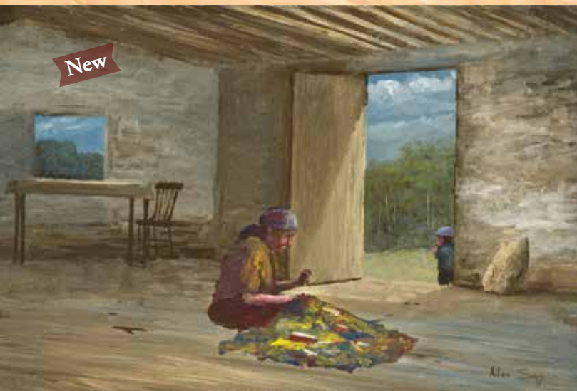
Making a Crazy Blanket

12½" X 19" Print $35 Matted $120 Framed $275