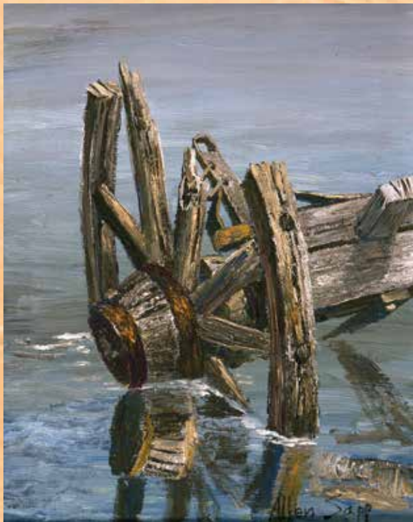
Broken Wheel on Reserve

11¼" X 19" Print $35 Matted $120 Framed $275