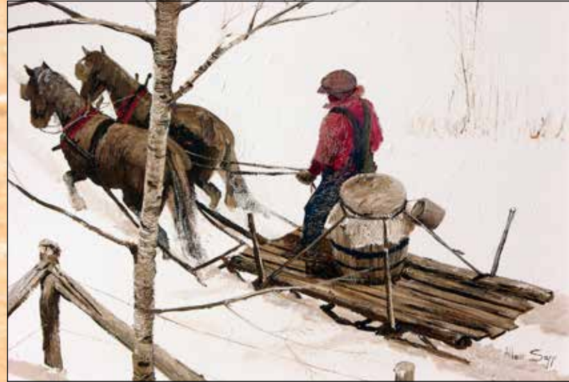
Taking Water Home