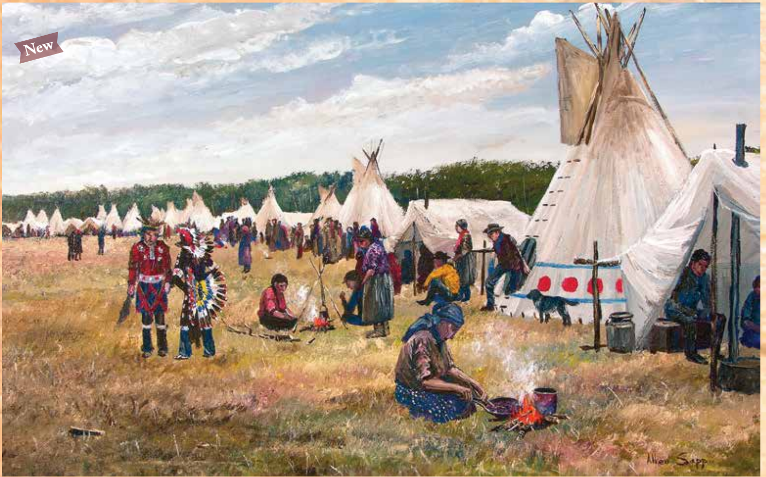
Pow Wow at the Battlefords

11¼" X 19" Print $35 Matted $120 Framed $275