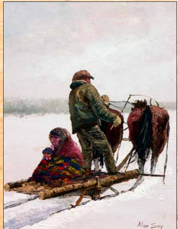
Late for the Meeting