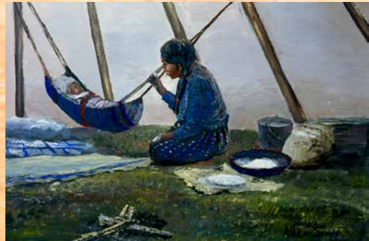
Baby Was Crying

11½" X 8½" Print $25 Matted $90 Framed $225