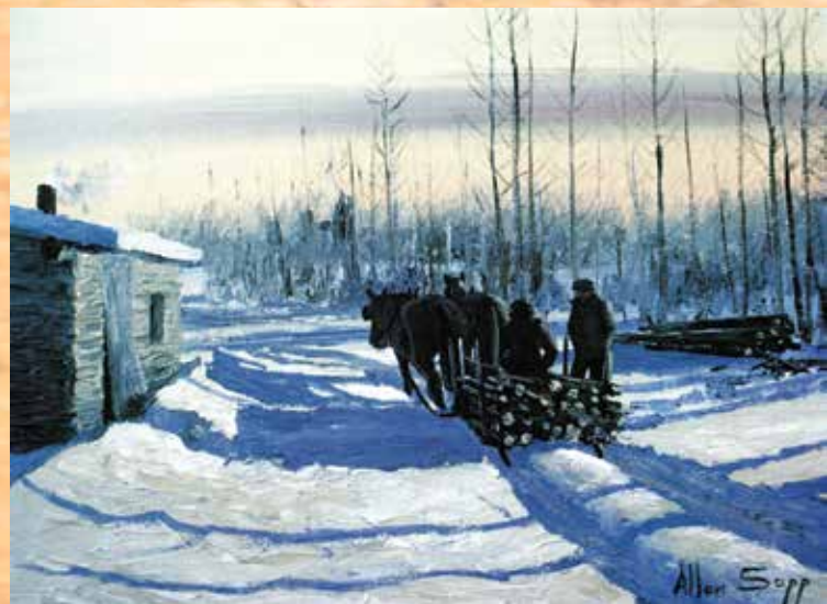
He Asked Me In for Tea