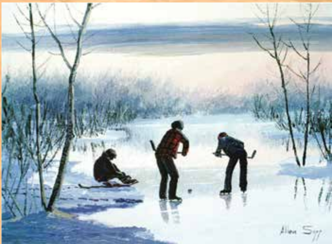
Boy Just In for Game