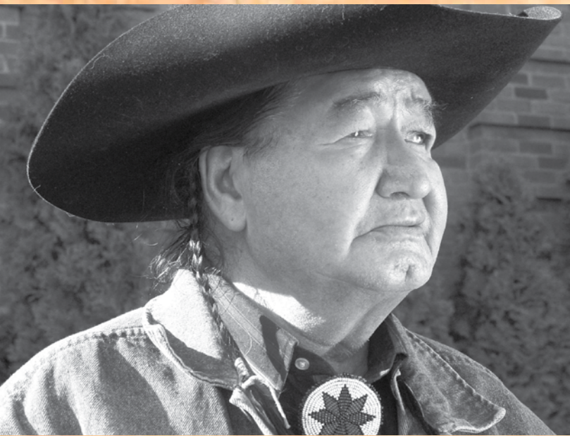
Dr. Allen Sapp, OC, RCA 1928–2015

World-renowned Cree artist Allen Sapp is recognized as one of Canada's preeminent painters and is a recipient of the Order of Canada , the Saskatchewan Order of Merit , the National Aboriginal Lifetime Achievement Award , and holds an honorary doctorate from the University of Regina.