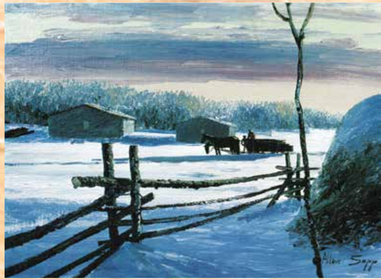
Load of Wood Ready to Go