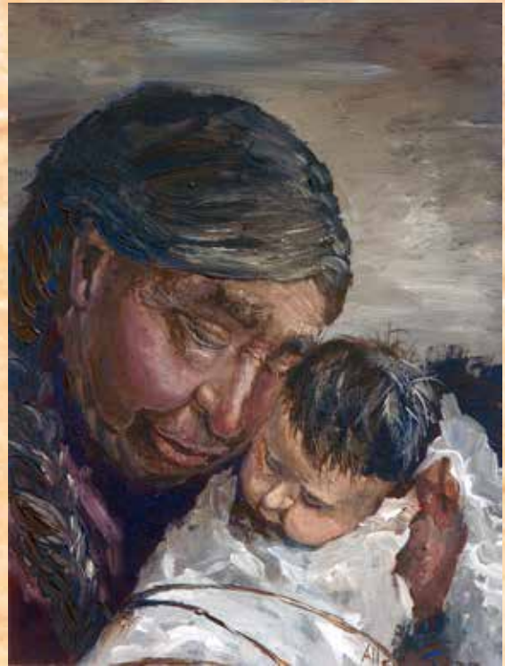
Baby is Sleeping

11½" X 8½" Print $25 Matted $90 Framed $225