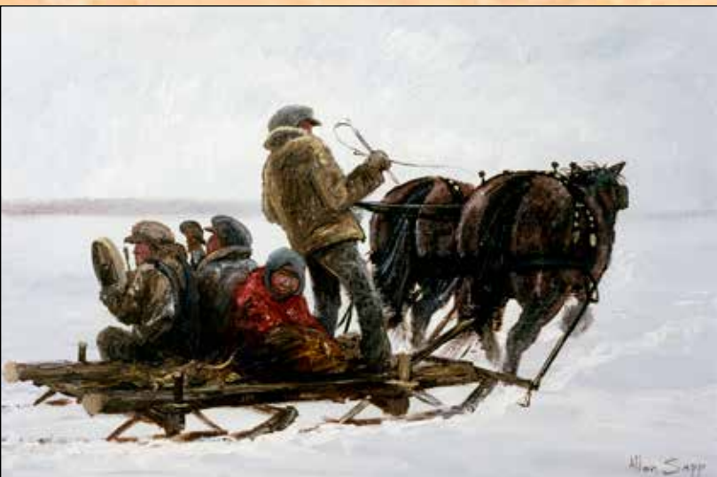
Four People on a Sleigh