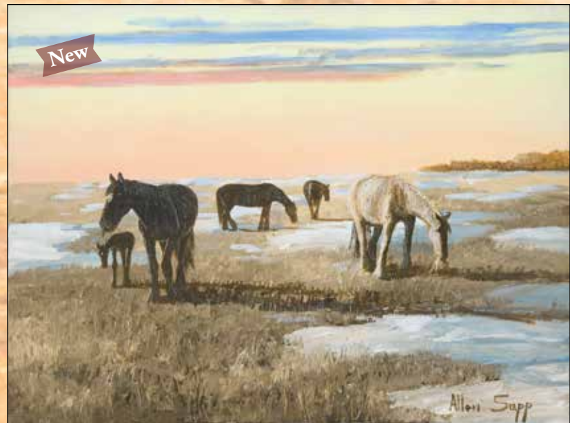
Two Baby Horses

9" X 6½" Print $20 Framed $110 18" X 13" Print $35 Matted $110 Framed $275