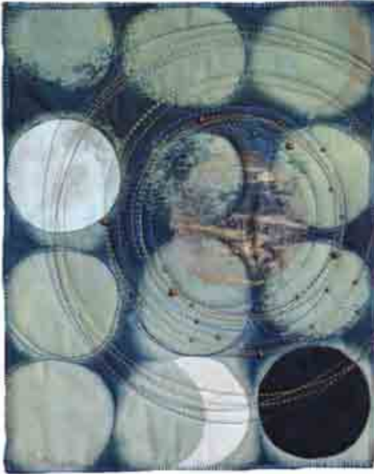
Carol Schmolde, Thirteen Moons , 2007, Indigo dyed cotton, hand appliqué, machine quilting, glass beads, painted fusible

artless fabrications: Carol Schmolde march 1 -4 and 10-25 main salon, chapel gallery