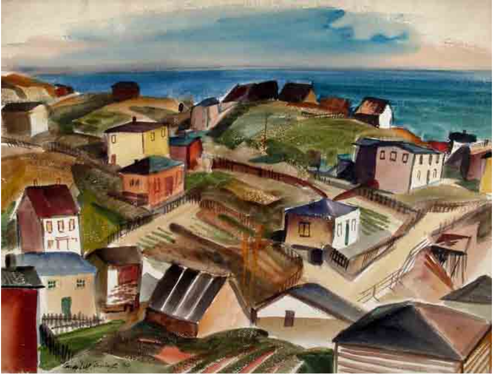
Campbell Tinning, untitled (Newfoundland) , 1949, watercolour on paper

Campbell Tinning: the Newfoundland series january 4 – february 28, 2012 main salon, chapel gallery